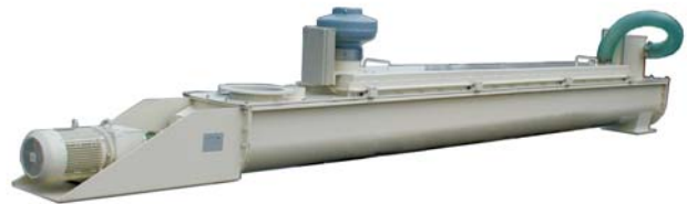
mixing and heating screw