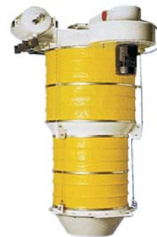
truck loading device